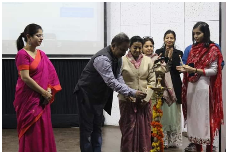
(Chhatrapati Shivaji Mahotsav)