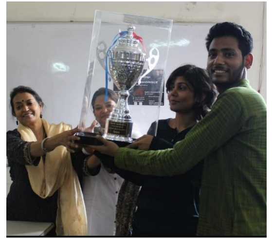
Shivaji Bhonsle Debating Event