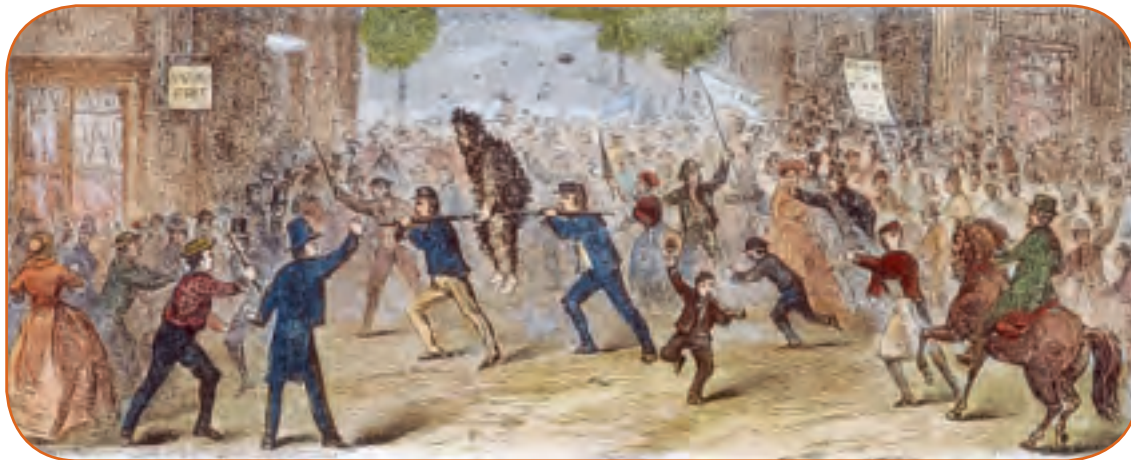
WHISKEY REBELLION, 1794 Rebels in Washington County, Pennsylvania, tar and feather a federal tax collector.

The validity of such doubts became apparent in September 1791 when a crowd tarred and feathered an excise agent near Pittsburgh. Western Pennsylvanians found the new tax especially burdensome. Unable to export crops through New Orleans, most farmers distilled their rye or corn into alcohol, which could be carried across the Appalachians at a fraction of the price charged for bulkier grain. Hamilton's excise equaled 25 percent of whiskey's retail value, enough to wipe out a farmer's profit.