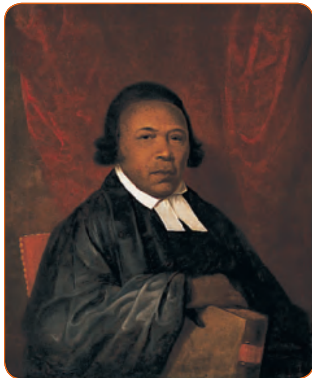
ABSALOM JONES, BY RAPHAEL PEALE, 1810 Born a slave, Jones was allowed to study and work for pay; eventually he bought his freedom. He became a businessman, a cofounder of the African Methodist Episcopal Church, and a stalwart in Philadelphia's free black community.

The slave revolution on Saint Domingue (which victorious blacks would rename Haiti in 1802) heightened slave owners' fears of violent retaliation by blacks. In August 1800, such fears were kindled when a slave insurrection broke out near Richmond, Virginia's capital. Amid the election campaign that year, in which Federalists and Republicans accused one another of endangering liberty and hinted at violence, a slave named Gabriel calculated that the split among whites afforded blacks an opportunity to gain their freedom. Having secretly assembled weapons, he and several other African Americans organized a march on Richmond by more than a thousand slaves. The plot of Gabriel's Rebellion was leaked on the eve of the march. Obtaining confessions from some participants, the authorities rounded up the rest and executed thirty-five of them, including Gabriel. "I have nothing more to offer than what General Washington would have had to offer, had he been taken by the British officers and put to trial by them," said one rebel before