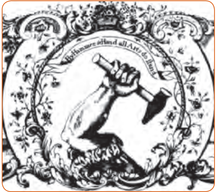
SEAL OF THE GENERAL SOCIETY OF MECHANICS AND TRADESMEN OF NEW YORK. Founded in 1785, the Society included artisans in a wide variety of crafts. During the 1790s, it was a major force in the emerging Republican Party.

Meanwhile, the Federalist-dominated Congress quadrupled the size of the regular army to twelve thousand men in 1798, with ten thousand more troops in reserve. Yet the risk of a land war with France was minimal. In reality, the Federalists wanted a military force ready in the event of a civil war, for the crisis had produced near-hysteria