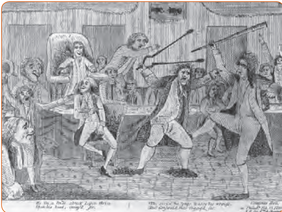
VIOLENCE IN THE HOUSE OF REPRESENTATIVES, 1798 Partisan bitterness turned violent when Republican Matthew Lyon (with tongs) and Federalist Roger Griswold fought on the House floor.

Recognizing that opponents of federal power would never prevail in the Supreme Court, which was still dominated by Federalists, Madison and Jefferson anonymously wrote manifestos on states' rights known as the Virginia and Kentucky Resolutions , adopted respectively by the legislatures of those states in 1798. Repudiating his position at the constitutional convention (see Chapter 6), Madison in the Virginia Resolutions declared that state legislatures had never surrendered their right to judge the constitutionality of federal actions and that they retained an authority called interposition , which enabled them to protect the liberties of their citizens. Jefferson's resolution for Kentucky went further by declaring that ultimate sovereignty rested