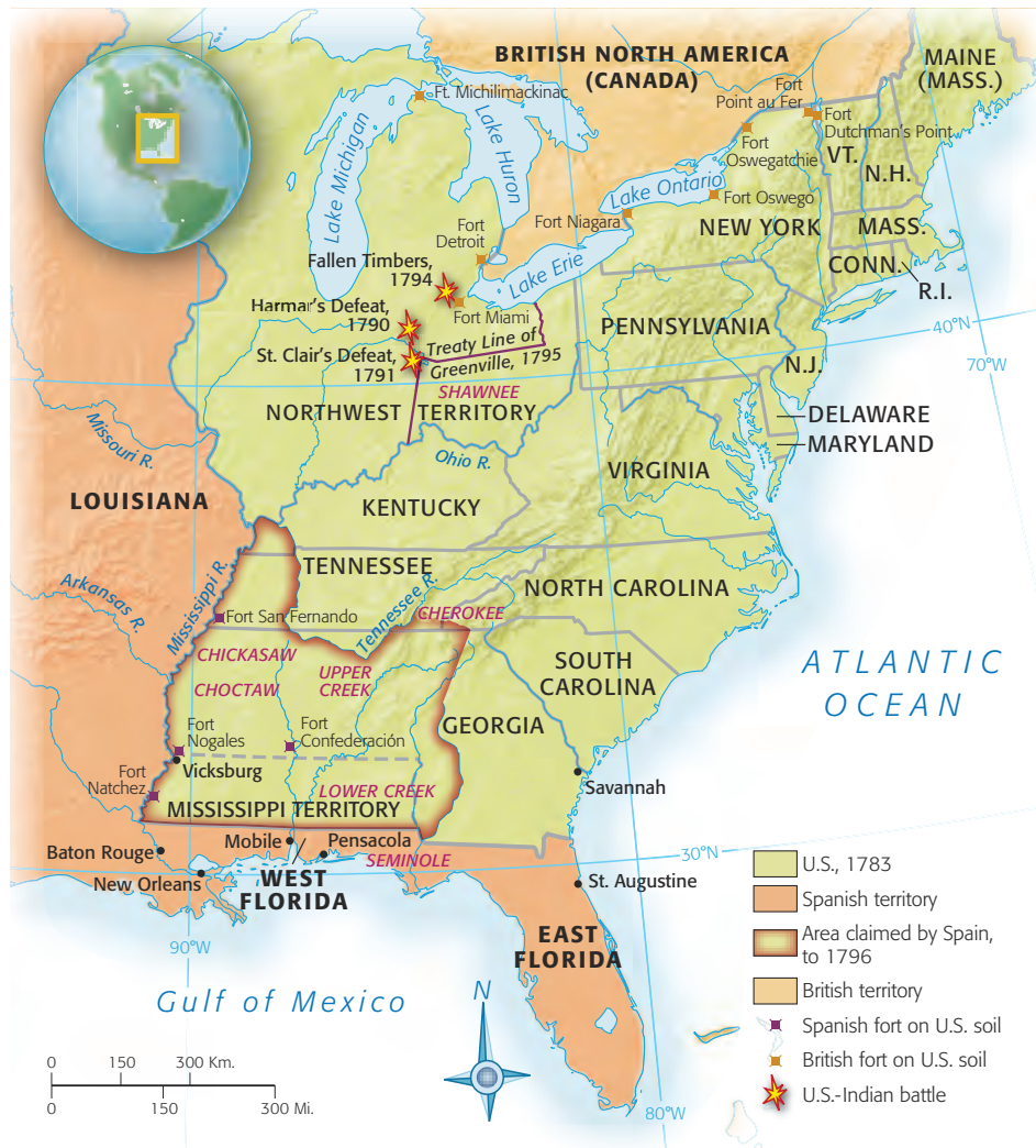
MAP 7.2 DISPUTED TERRITORIAL CLAIMS IN THE WEST, 1783–1796 Until 1796, Britain, Spain, and their Native American allies controlled much of the western territory claimed by the United States.

Washington and his secretary of war, Henry Knox, adopted a harsher policy toward Native Americans who resisted efforts by American citizens to occupy the Ohio valley. In 1790, the first U.S. military effort collapsed when a coalition of tribes chased General Josiah Harmer and 1,500 troops from the Maumee River. A second campaign failed in November 1791, when one thousand Shawnee warriors surrounded an encampment of fourteen hundred soldiers led by General Arthur St. Clair. More than six hundred soldiers were killed and several hundred wounded before the survivors could flee for safety.