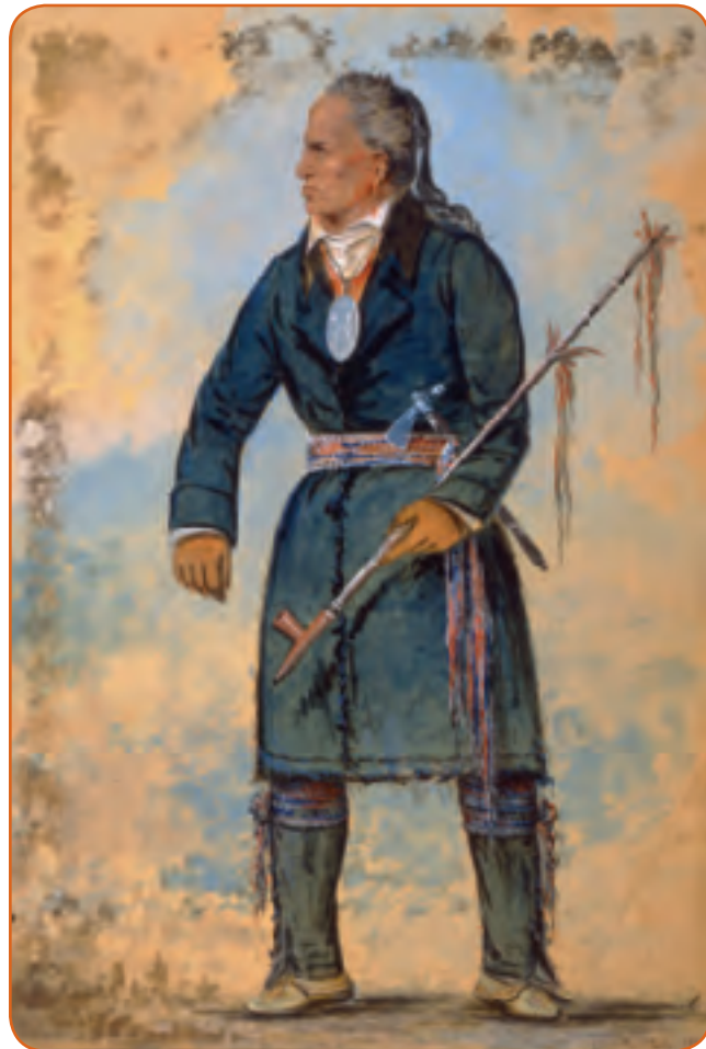
RED JACKET, SENECA IROQUOIS CHIEF (ca. 1750–1830) Red Jacket was an eloquent defender of Seneca traditions against the efforts of both Christian missionaries and Handsome Lake to change Seneca religion and culture.

The most traditional Senecas rejected Handsome Lake’s message that Native men should work like white farmers. While many Seneca men welcomed the change, women often resisted because they stood to lose their control of farming and their considerable political influence. Some of Handsome Lake’s supporters accused women who rejected his teachings of witchcraft, and even killed a few of them. The violence soon ceased and Handsome Lake’s followers formed their own church, complete with traditional Iroquois religious ceremonies. The Seneca case would prove to be unique; after 1800, missionaries would expect Native Americans to convert to Christianity as well as adopt “civilization.”