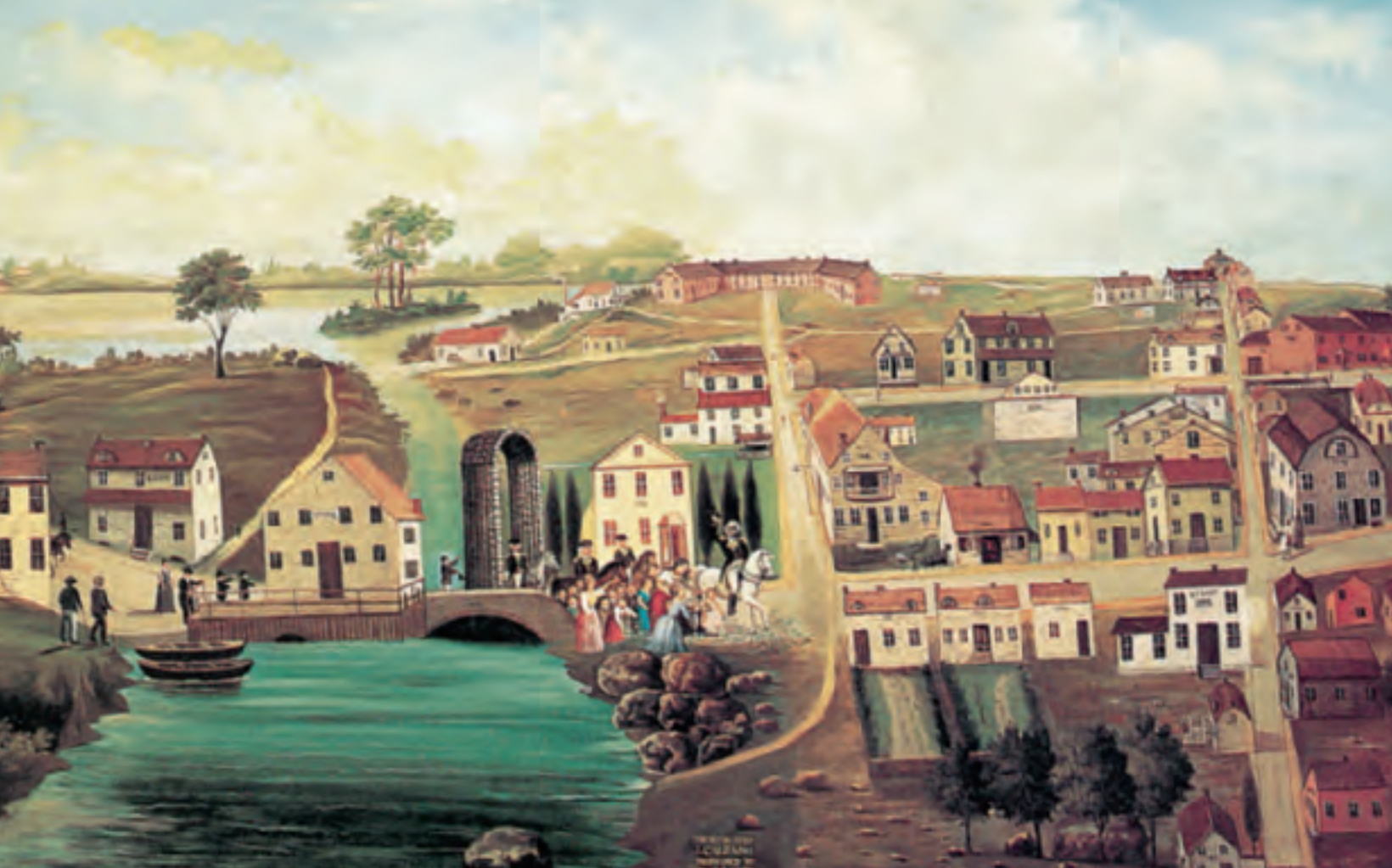
GEORGE WASHINGTON'S INAUGURAL JOURNEY THROUGH TRENTON, 1789 Washington received a warm welcome in Trenton, site of his first victory during the Revolutionary War.

With the Judiciary Act of 1789, Congress quieted popular apprehensions by establishing in each state a federal district court that operated according to local procedures. As the Constitution stipulated, the Supreme Court exercised final jurisdiction. Congress had struck a compromise between nationalists and states' rights advocates, one that respected state traditions while offering wide access to federal justice.