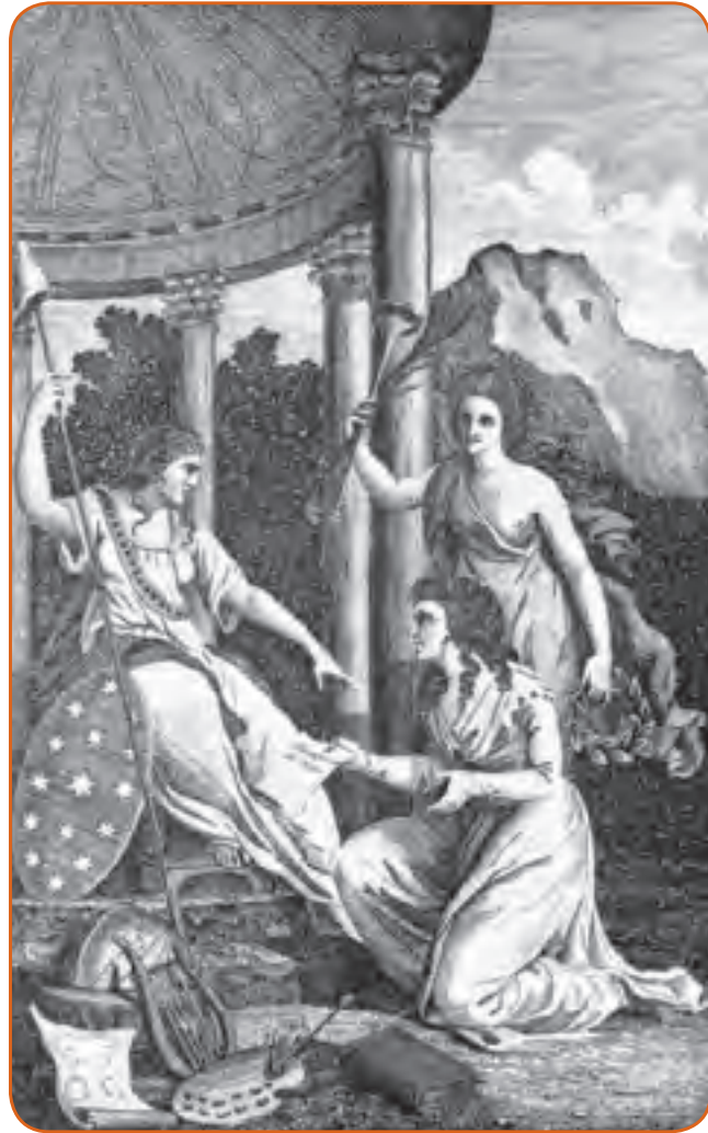
ADVOCATING WOMEN'S RIGHTS, 1792 In this illustration from an American magazine for women, the “Genius of the Ladies Magazine” and the “Genius of Emulation” present Liberty with a petition based on British feminist Mary Wollstonecraft’s Vindication of the Rights of Woman .

Although the great struggle for female political equality would not begin until the next century, assertions that women were intellectually and morally men’s peers, and that republican mothers played a vital public role, provoked additional calls for equality beyond those voiced by Abigail Adams and a few other women during the Revolution (see Chapter 6). In 1793, Priscilla Mason, a student at a female academy, blamed “ Man , despotic man” for shutting women out of the church, the courts, and government. In her graduation speech, she urged that a women’s senate be established by Congress to evoke “all that is human—all that is divine in the soul