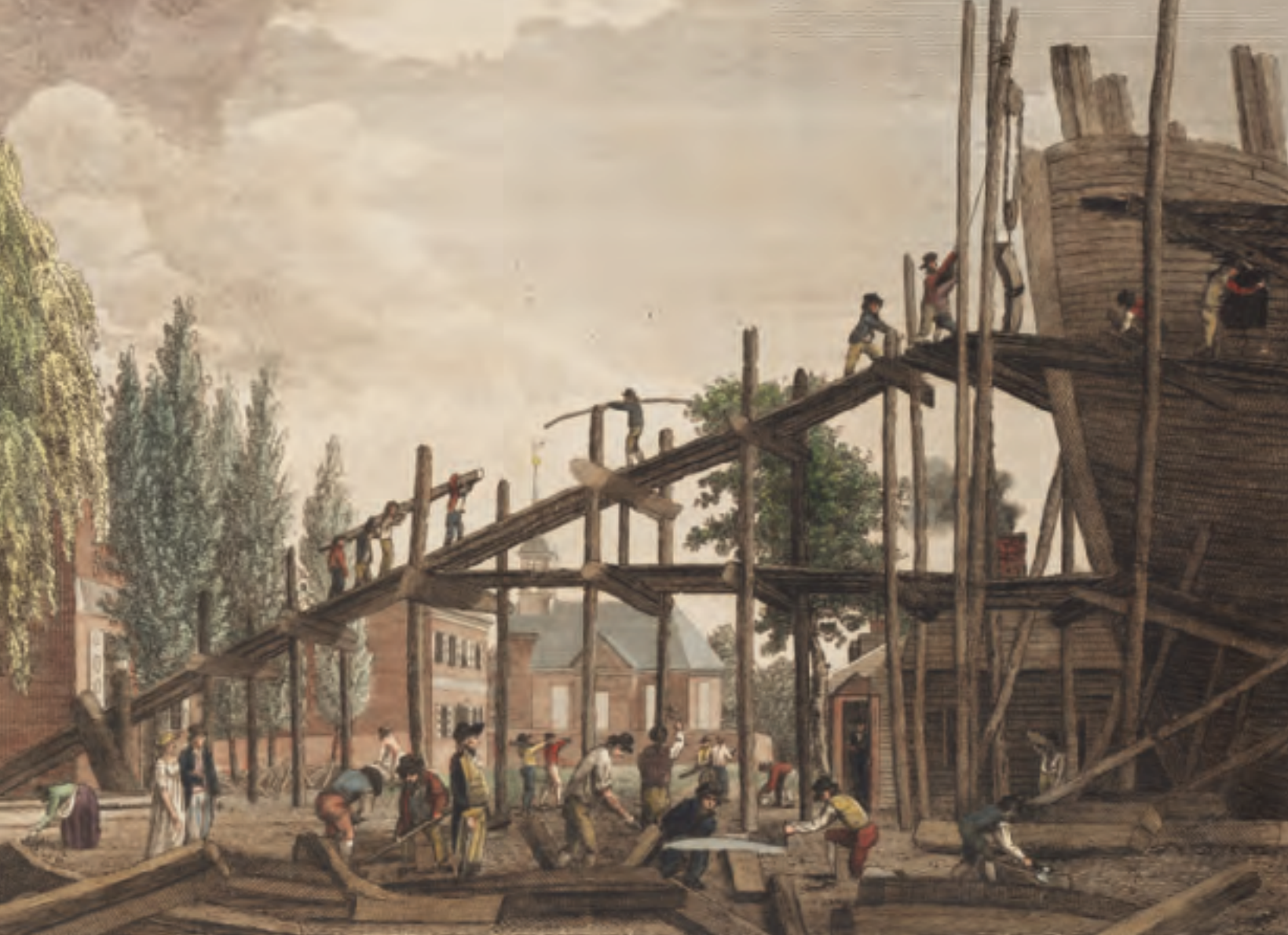
“PREPARATION FOR WAR TO DEFEND COMMERCE” (1800) BY WILLIAM BIRCH Birch’s engraving depicts the building of the frigate, Philadelphia , during the Quasi-War.

residents whose activities he considered dangerous. The law did not require proof of guilt, on the assumption that spies would hide or destroy evidence of their crime. Republicans maintained that the law’s real purpose was to deport immigrants critical of Federalist policies.