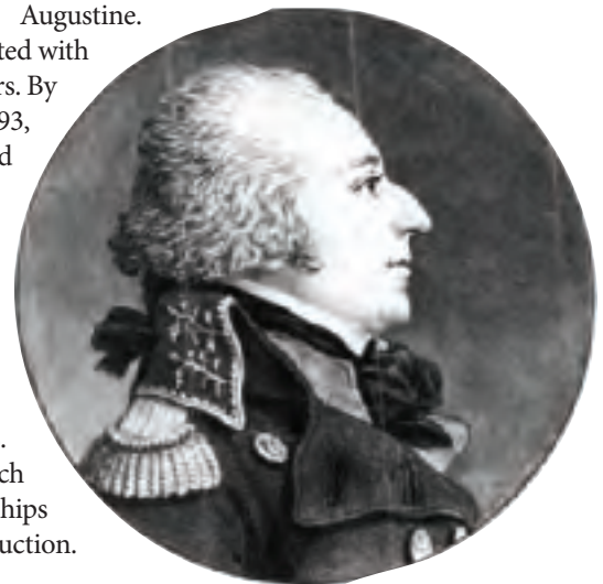
CITIZEN EDMOND GENET After the French diplomat actively recruited American citizens to the French cause, the French government recalled him at the request of the United States.

The French Revolution was “an open hell,” thundered Massachusetts’s Fisher Ames, “still ringing with agonies and blasphemies, still smoking with sufferings and crimes.”