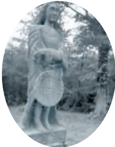
NANCY WARD

FOR NANCY WARD , as for all Americans, the 1790s was a decade marked by political and economic transformation. But whereas many Americans cautiously hoped the new republic would offer them a secure future, Ward, a Cherokee Indian, had less reason to be optimistic. Born in about 1738, with the name Nanye'hi, she became a "War Woman" (or "Beloved Woman") in 1755 when, after attacking Creeks killed her husband, she picked up his