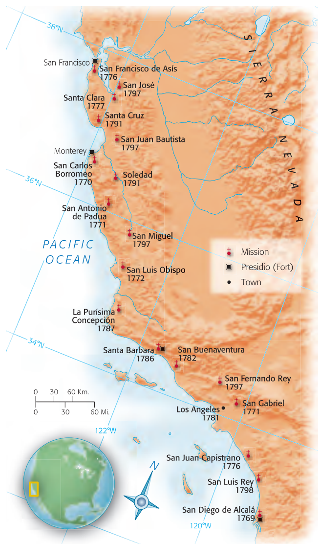
MAP 7.1 SPANISH SETTLEMENTS IN ALTA CALIFORNIA, 1800 While the United States was struggling to win its independence, Spain was establishing a new colony on the Pacific coast.

Perceiving Russia's move into Alaska as a threat, Spain expanded northward on the Pacific coast from Mexico. In 1769, it established the province of Alta California (the present American state of California) (see Map 7.1). Efforts to encourage