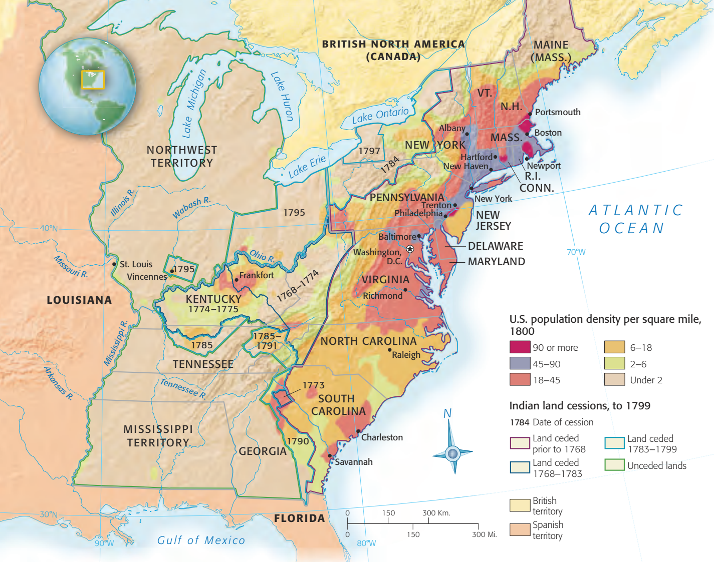
MAP 7.3 AMERICAN EXPANSION AND INDIAN LAND CESSIONS, 1768–1800 As the U.S. population grew, Native Americans were forced to give up extensive homelands throughout the eastern backcountry and farther west in the Ohio and Tennessee River valleys.

the Mississippi had suffered severe losses of population, territory (see Map 7.3), and political and cultural self-determination. Thousands of deaths had resulted from battle, famine, and disease during successive wars since the 1750s and from poverty, losses of land, and discrimination during peacetime. From 1775 to 1800, the Cherokee population declined from sixteen thousand to ten thousand, and Iroquois numbers fell from about nine thousand to four thousand. During the same period, Native Americans lost more land than the area inhabited by whites in 1775. Settlers, liquor dealers, and criminals trespassed on Indian lands, often defrauding, stealing, or inflicting violence on Native Americans and provoking them to retaliate. Indians who sold land or worked for whites were often paid in the unfamiliar medium of cash and then found little to spend it on in their isolated communities except alcohol.