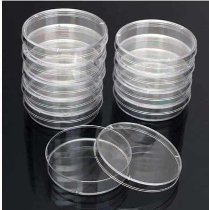
Sterile/Non sterile 100/90mm/15mm