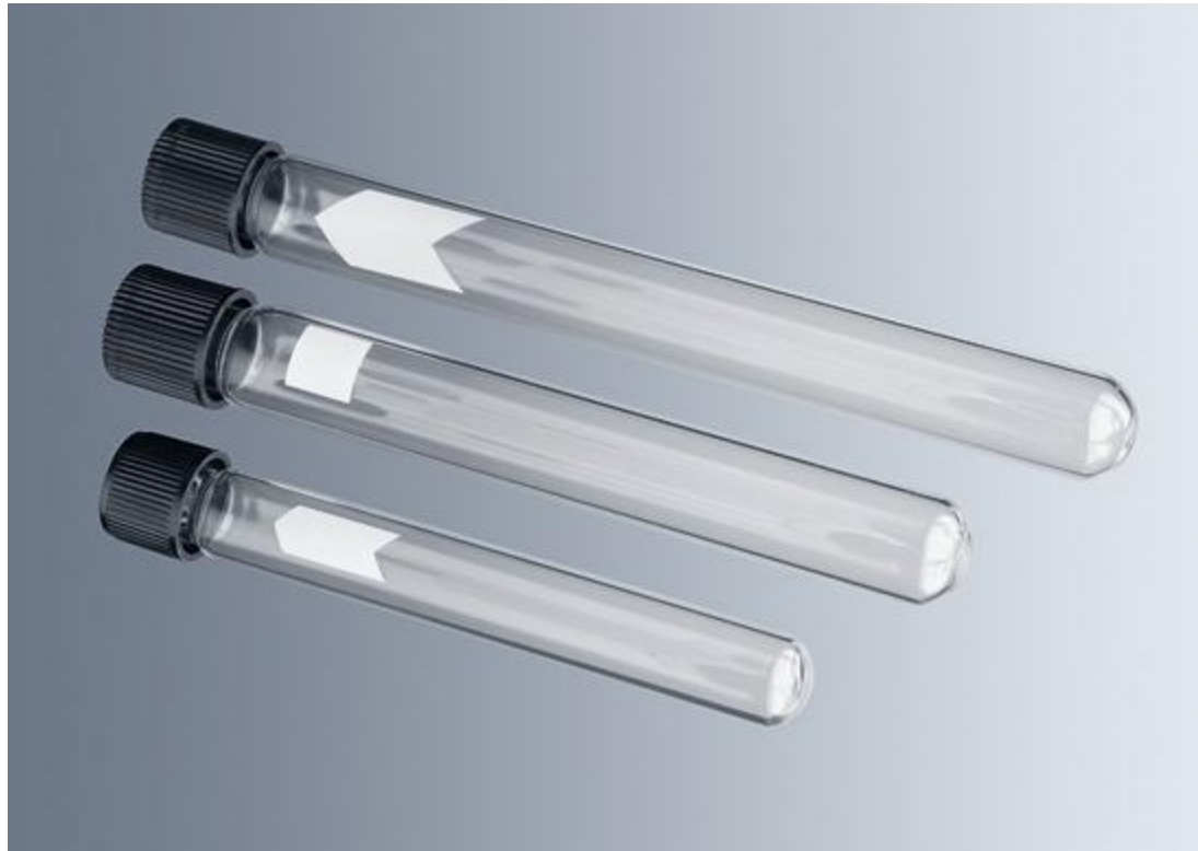
Screw cap culture tubes