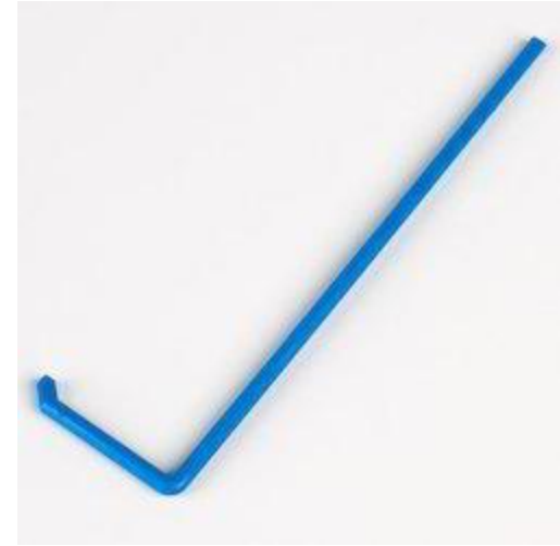
Plastic disposable Spreader