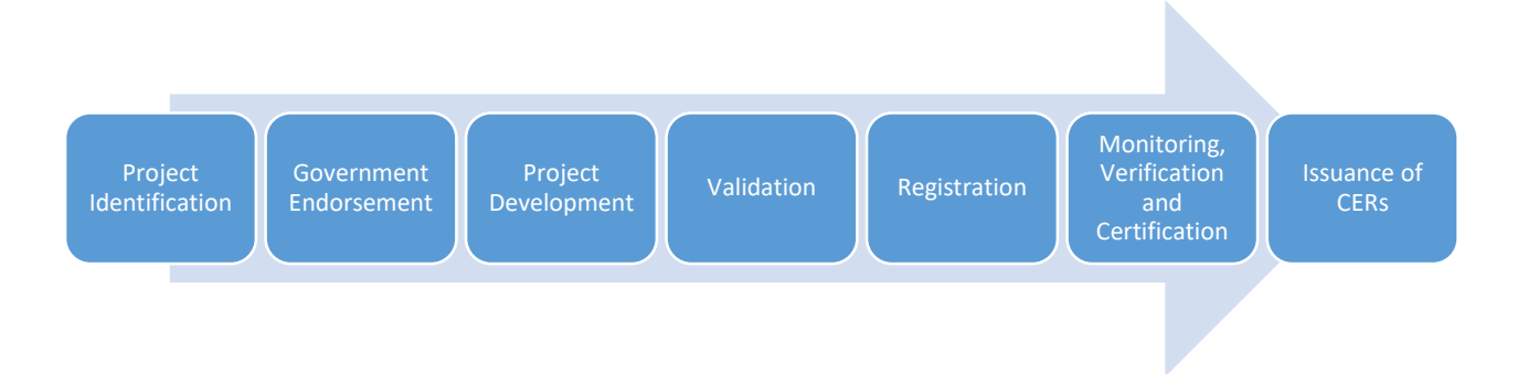
Fig.2. Project Cycle of CDM

From the inception of a CDM project activity till the delivery of Certified Emission Reductions (CER), a CDM project undergoes various steps and there are some bodies which play an important role in the entire project cycle of a CDM project. Broadly speaking, the project cycle involves the following steps and bodies: