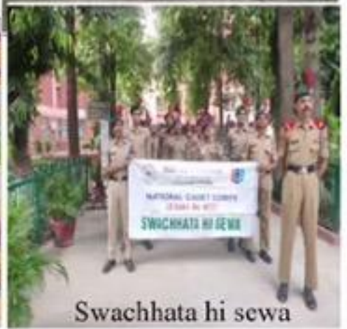
Swachhata hi sewa