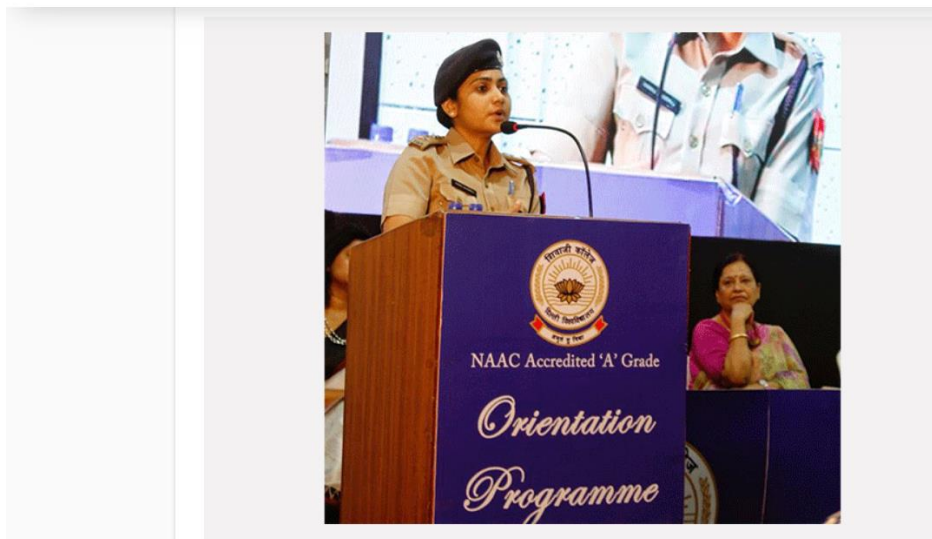
Shivaji College organises Orientation Programme for freshers