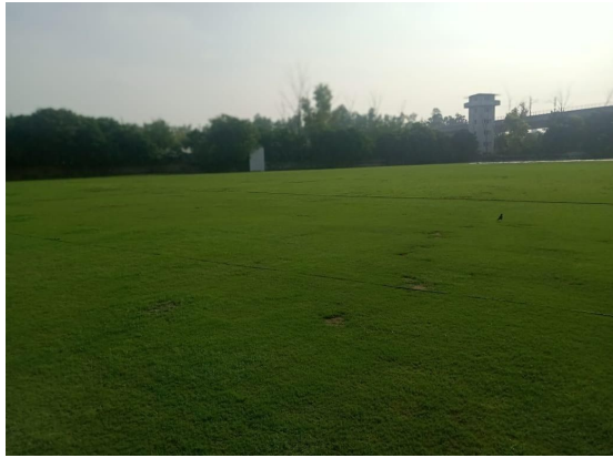
400m Grass athletic track