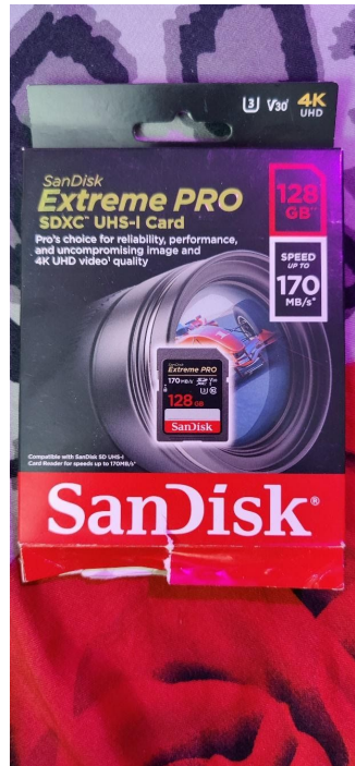
SanDisk 128GB memory card