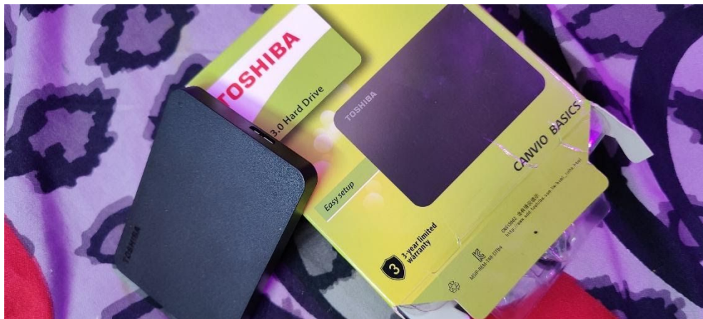
Toshiba Hard Drive