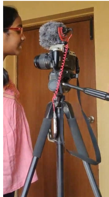
Rode Camera Microphone