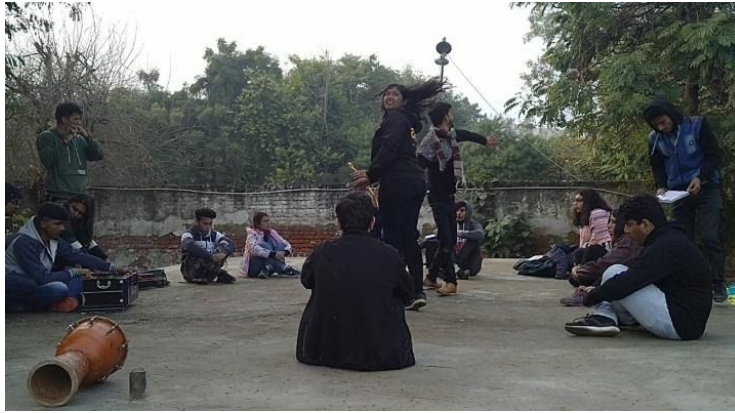
Stage in the sports complex