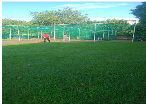
Cricket nets (cemented and turf)