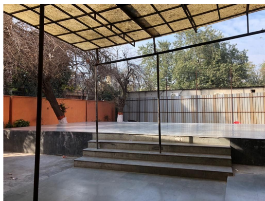
Back stage for practise