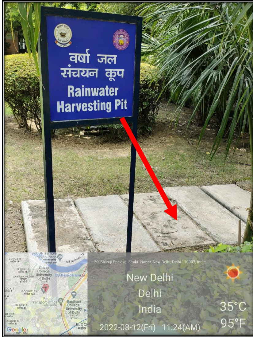
Rainwater harvesting pit located in main lawn of the college having gravel-sand filtration mechanism